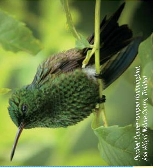
Perched Copper-rumped Hummingbird, Asa Wright Nature Centre, Trinidad