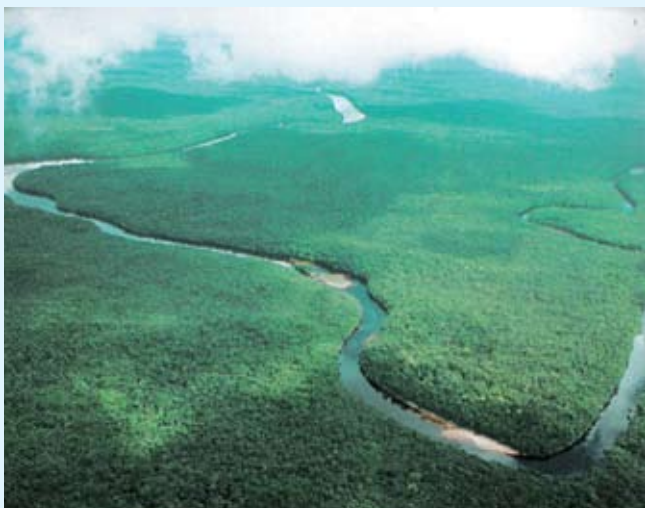
The Orinoco Delta