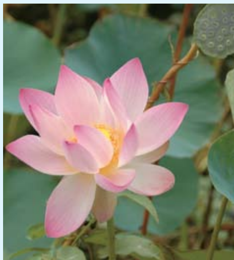
Lily pond in Guyana

including several endangered species. Return to Georgetown to re-board the ship. (B, L, D)