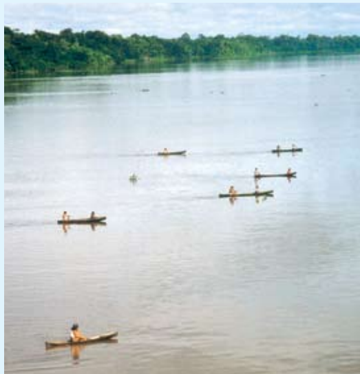
Warao people on the Orinoco River

FOR RESERVATIONS OR INFORMATION, PLEASE CALL US AT 800-856-8951