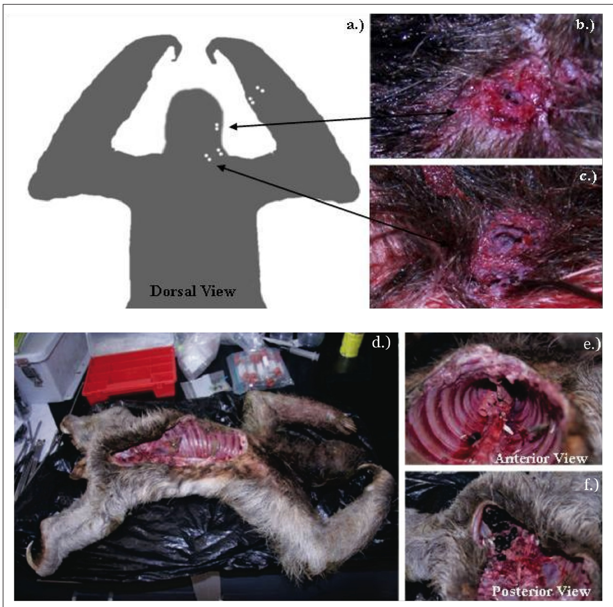
Figure 2. Diagram and photographs of freshly killed sloth. (a) Locations of five paired puncture wounds. (b) Close up views of punctures to side of the head and (c) the trapezius region of the back. (d) Ventral view of the cleanly disemboweled sloth carcass. (e) Close up view of the pericardial cavity and cleanly cut trachea, and (f) posterior view showing sloth feces in the rectum.

Sloths have not been reported in the diet of owls, but are commonly eaten by medium-sized and large felids (Sunquist and Sunquist, 2002; Moreno et al. , 2006) and eagles (Fowler and Cope, 1964; Galetti and Carvalho, 2000; Touchton et al. , 2002). We are fairly confident that the predator was not a harpy eagle ( Harpia harpyja ), as they were not known from BCI at the time, do not hunt in the