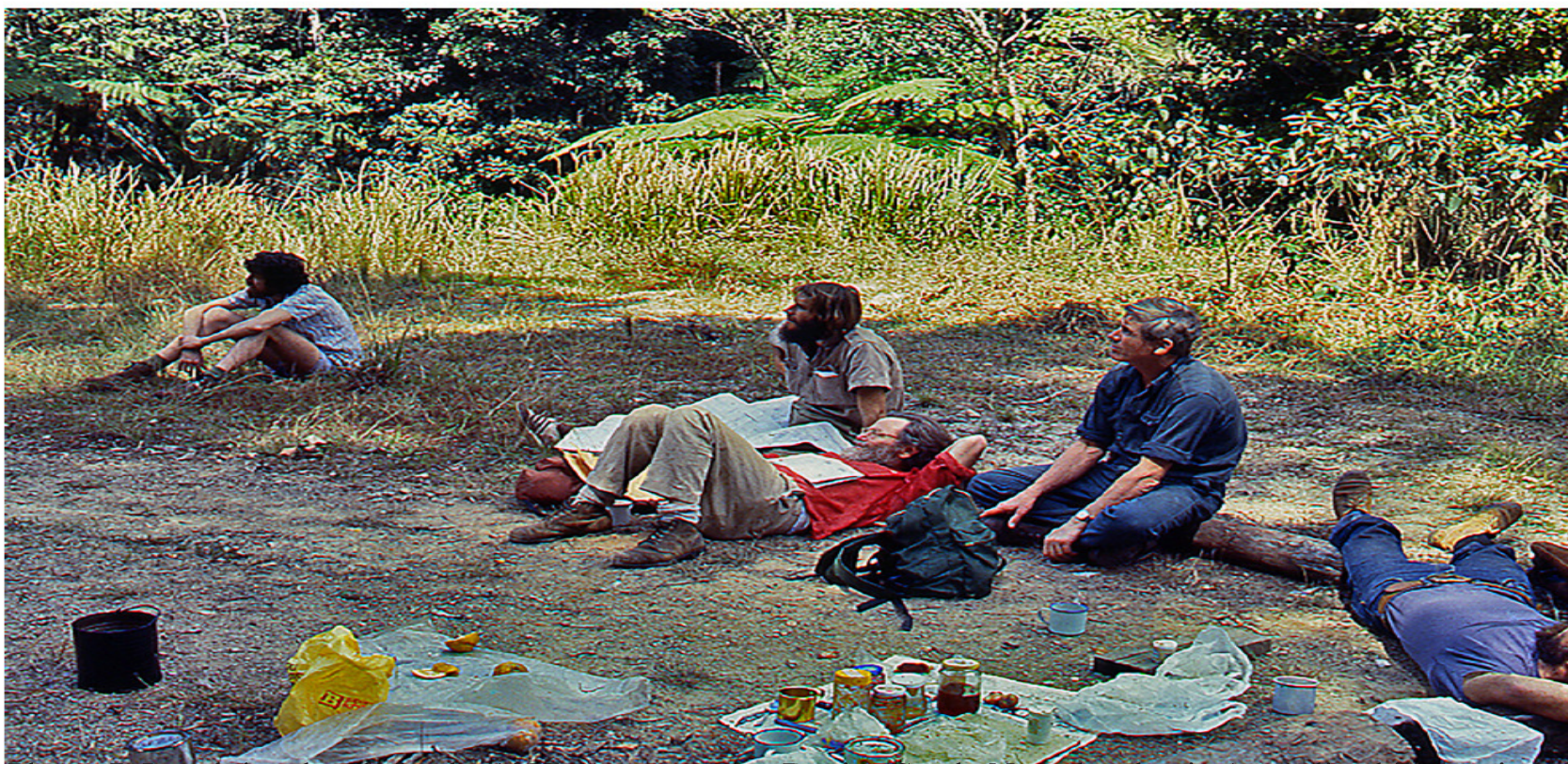
Photo. 7. Lunchtime break for the 1977 census crew at Davies Creek. Note the classic Australian billycan in left foreground.