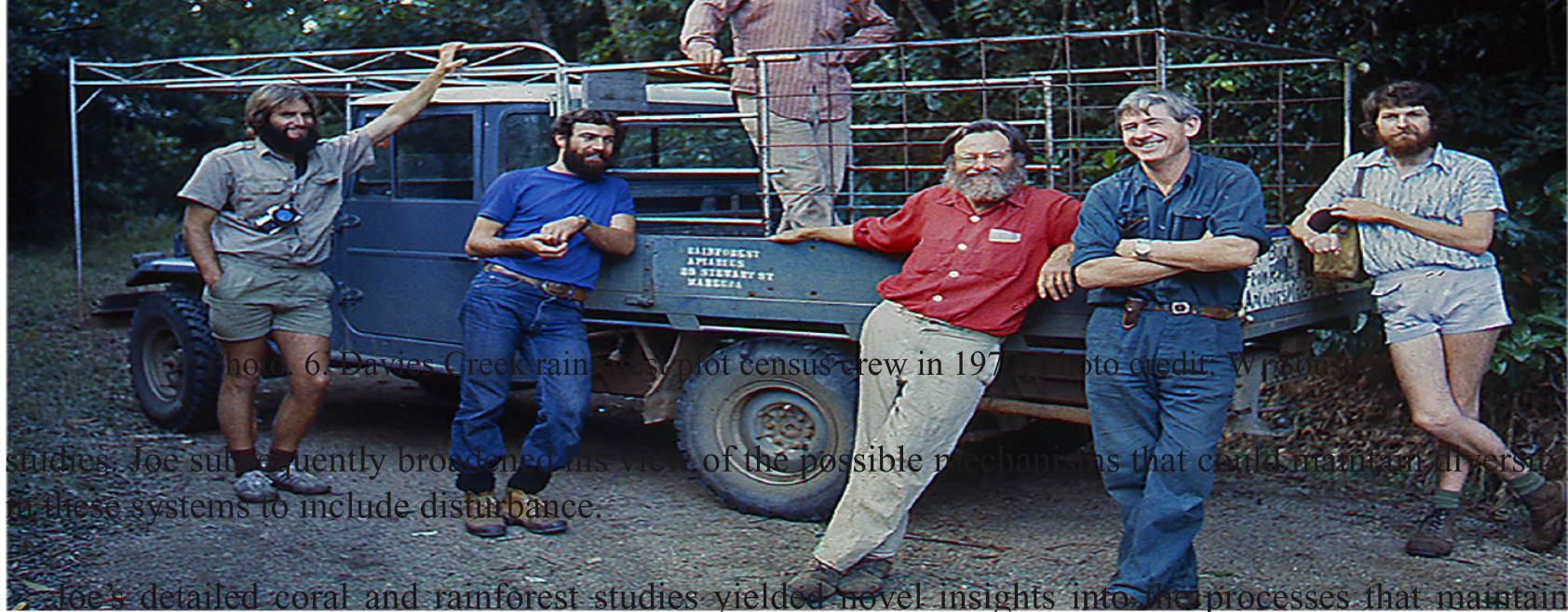
Photo 6. Davies Creek rainforest plot census crew in 1977.

studies. Joe subsequently broadened his view of the possible mechanisms that could maintain diversity in these systems to include disturbance.